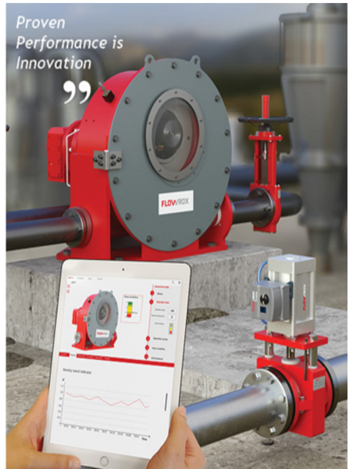
Figure 5. Flowrox digitalized pump and valve monitoring allows for early detection of required maintenance. Customers are able to reduce downtime, maintenance costs and speed repair. Flowrox digital platform is called Malibu and can be used to monitor performance of Flowrox products, as well as, any asset found in a customer's process. Malibu is also capable to perform complete system wide monitoring.

Todd Loudin is the President of the Flowrox's North American operations and Vice President of Global Sales. Bachelor of Sciences and XMBA Loyola College. He can be reached at todd.loudin@flowrox.com or 410.636.2250.