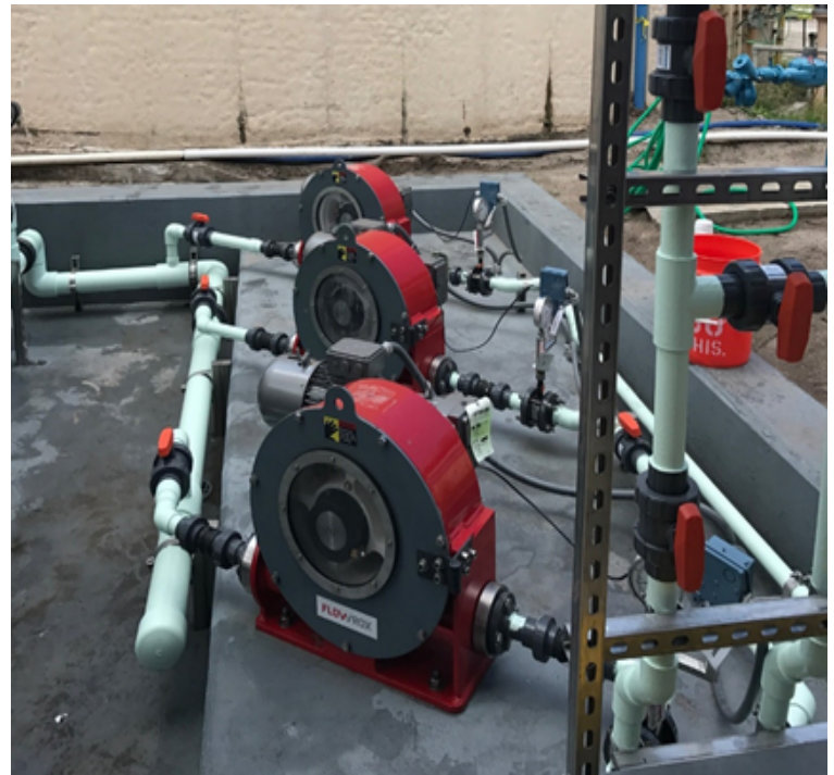
Figure 1. Flowrox single roller design peristaltic pumps hoses lasted approximately 9 months and survived in excess of 11 million revolutions while pumping abrasive lime slurry.

The city of Hamilton Ohio power plant replaced some shoe design pumps 4” peristaltic pumps where the hose lifetime was as little as 518,400 revolutions. When Flowrox replaced the shoe design pumps with a 2.5” Flowrox single roller design pumps the hose lifetime improved to over 2.7 million revolutions. Flowrox saved the customer $20K annually on spare parts and maintenance by making the change.