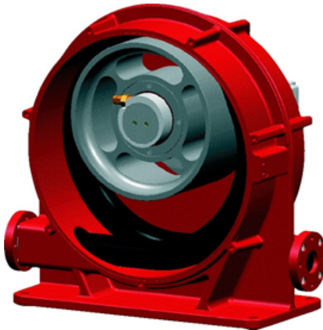
Figure 4. Depicts a Flowrox single roller design peristaltic pump. This design compresses the hose only once per revolution. Shoe design and double roller designs compress the hose two times per revolution. For this reason, the Flowrox pump hoses last minimally twice as long because they have one half the number of compressions. Also, since no heat is generated by the Flowrox design the hoses typically last 3 - 5 times longer than shoe designs.

With significant operating expense savings produced by Flowrox single rolling designs, customers have to understand that if they purchase these shoe design pumps that they will pay the very high operating expenses on the shoe design pumps every year. If they purchase the shoe design pumps for lower initial costs or Capex then they will pay dearly on the back end. In the City of Hamilton, OH it would cost $204,525.37 in operating costs over 7 years to run the shoe design pumps. With the Flowrox design, it would cost only $63,488.60 over 7 years to operate the Flowrox pumps. The total savings over 7 years by using the Flowrox pumps would be $141,036.77. In many competing pump manufacturer's designs, the results typically are not this significant.