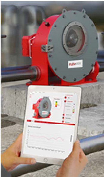
Figure 3. Digital twin imagery viewed from smart tablet.

Two different brands of pumps or all types of industrial machinery can be equipped with IloT monitoring. Through constant monitoring a user can truly determine which pump has the lowest total cost of ownership. All failures and alarms will be tracked. All costs of repairs and downtime can also be monitored. Flowrox's Malibu Smart Solutions can be installed on any piece of industrial equipment to provide a comprehensive analysis of any given asset. Flowrox personnel will consult with the user to determine what they would like to monitor. Additional instrumentation may be required to provide feedback of asset condition.