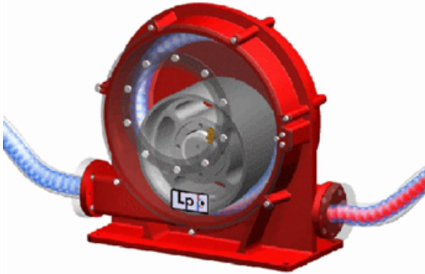
Figure 2. Above depicts a Flowrox eccentric rolling design peristaltic pump. This pump can be run 24/7 at a full 120 revolutions per minute and not generate any significant heat or damage to the hose or bearings of the pump.

So by simply compressing the rubber hose half as many times as a shoe design or multiple roller design, the single roller design can improve pump availability and reduce operating costs. Because there is no heat generation found in single roller designs, the single roller design can achieve hose life 2 – 5 times longer than shoe designs. If you compare the maintenance costs of the two designs, the savings can be staggering when using the rolling design. Manufacturers of the shoe design pumps push owners to purchase larger diameter pumps to keep the RPM lower. This is a sound practice, but in many cases a much smaller rolling design can be used, which costs much less and takes up much less space.