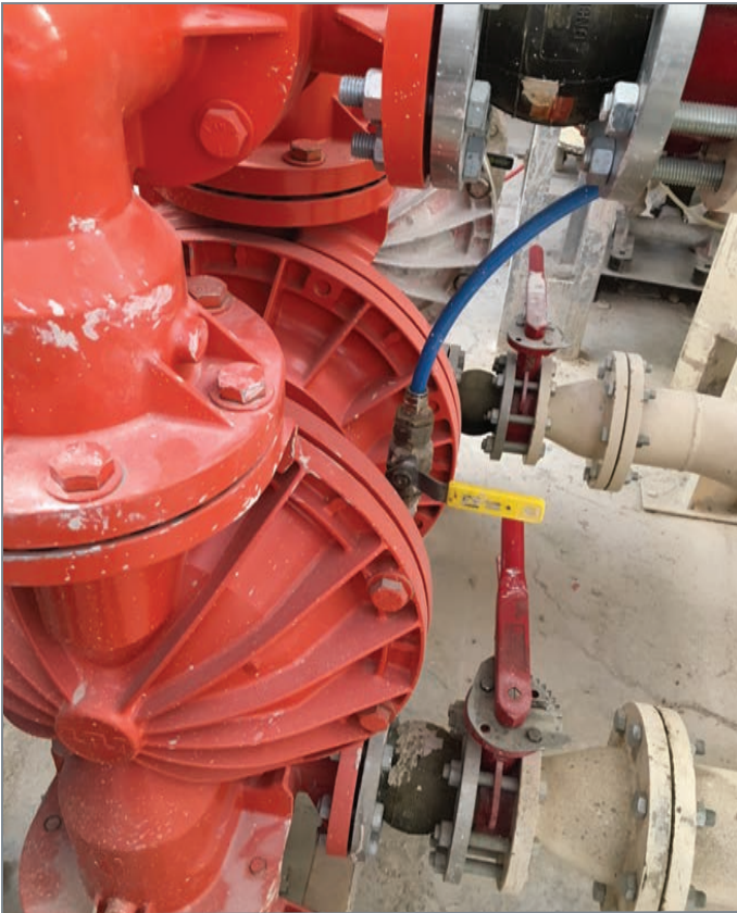
Improved diaphragm design was the next frontier in the further optimization of AODD pump performance and the integral piston diaphragm (IPD) helps realize improved diaphragm operation.

To help manufacturers become more familiar with the various materials of diaphragm construction and find the best diaphragm for their operations, Wilden® has produced a technical article that addresses these areas in-depth.