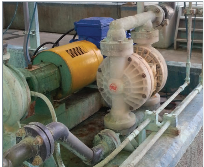
Traditional diaphragm designs feature inner and outer plates that connect the diaphragms to the pump shaft. While this design does have its operational benefits, there are some shortcomings that can lead to the creation of leak points that can affect product containment, which is especially critical when handling dangerous or hazardous materials.

Taking into account the problems that abrasion wear and material buildup can cause, the industry worked diligently to develop the integral piston diaphragm, or IPD. Within the IPD design, the piston that is used to move the diaphragm laterally during the pumping stroke is encapsulated into the interior of the diaphragm itself. IPDs also have a smooth finish with an angle of operation that enhances fluid flow and suction lift while reducing the propensity for material buildup on the outer piston.