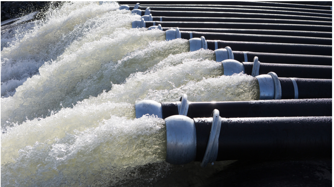
Savings can be made by using the optimal piping diameters

In this example, using 8-inch pipes, operators could save up to 1 gallon of fuel each hour.