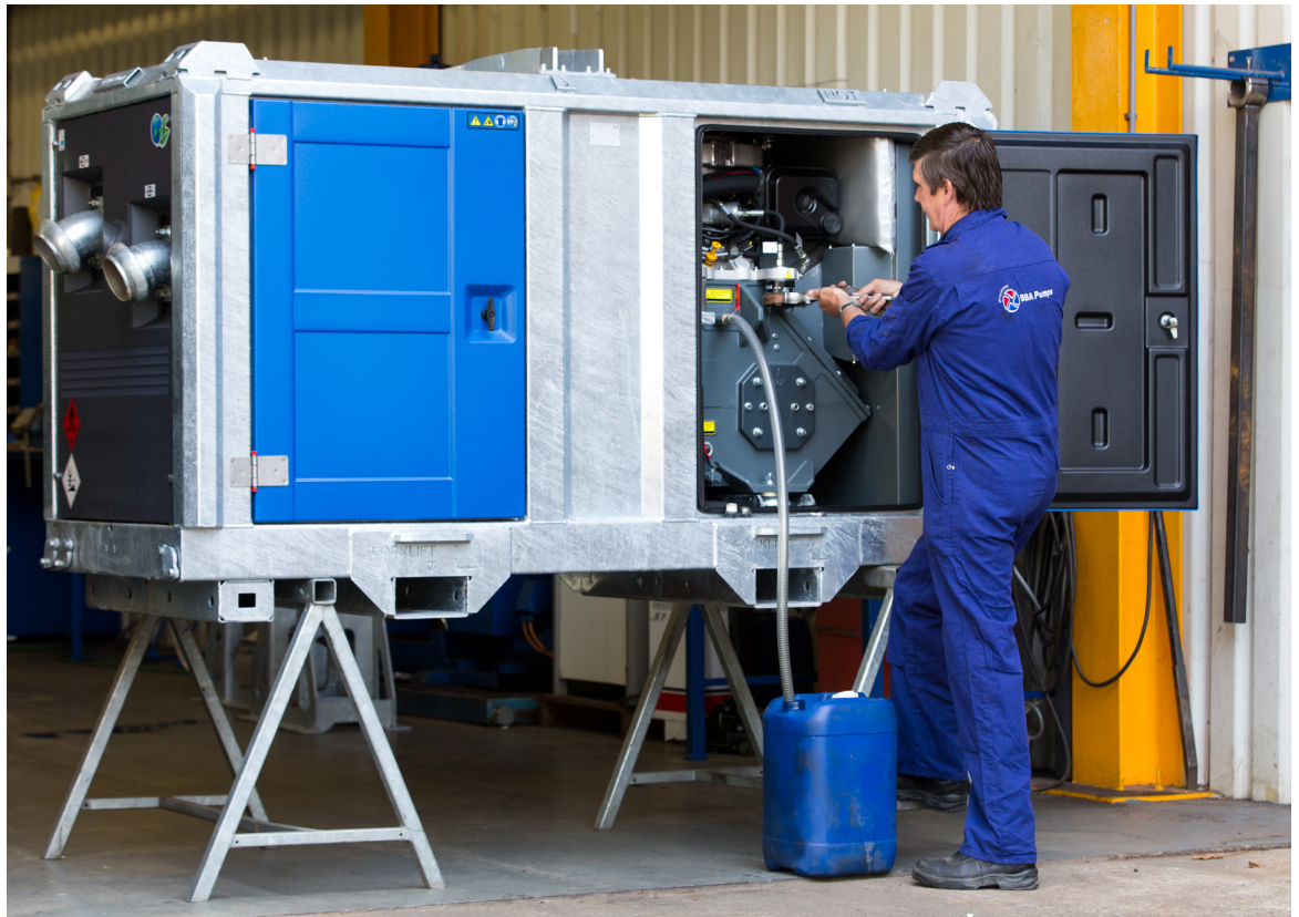
With the DriveOn® feature only 20 oil changes are required during an engine lifetime an estimated (30,000 hours).

In practice, the same pump with an automatic start/stop function will run for a few hours per day, so the fuel consumption will only be 13 to 16 gallons per day. This also results in savings on regular maintenance of the pump unit.